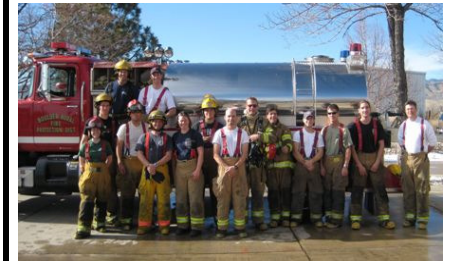
2008 Firefighter Academy